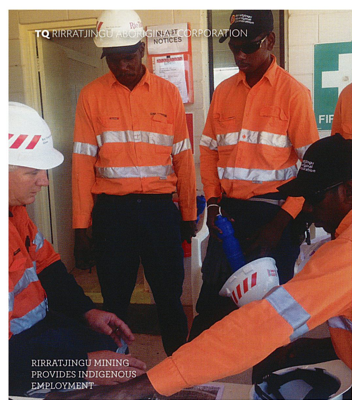
RIRRATJINGU MINING PROVIDES INDIGENOUS EMPLOYMENT